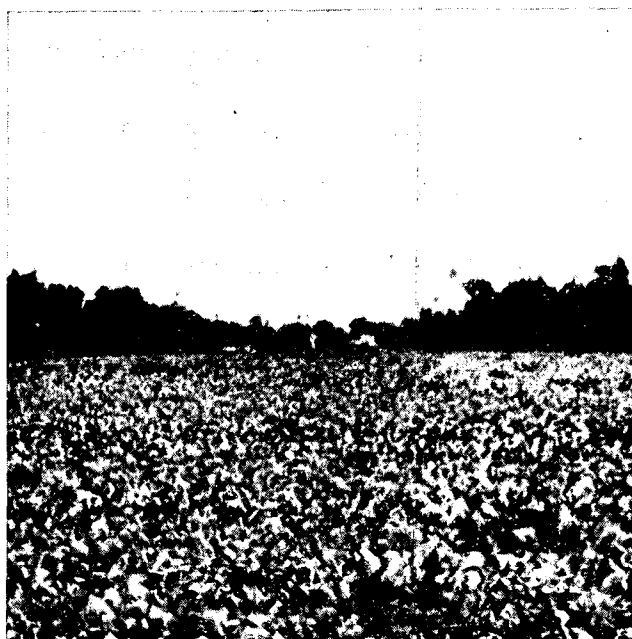
Hyacinth blocking the river

The short Enseleni River in Zululand and the series of small lakes running into Richards Bay are choked with water hyacinth. Last year a planter commenced raking out the plants and placing them on the land. Other than this, the plant is still a curiosity devoted to sunken gardens and glass jars, and only recently has it been deproclaimed as a noxious weed.