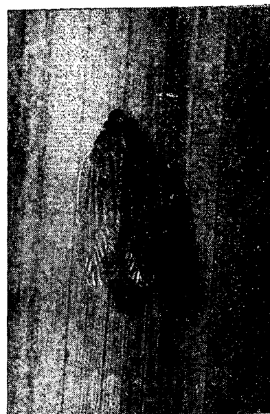
3. Adult \times 5 .