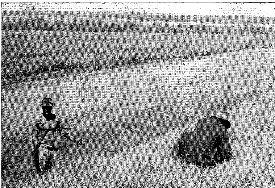
FIGURE 2: Quadrat sampling on reservoir bank adjacent to cane.