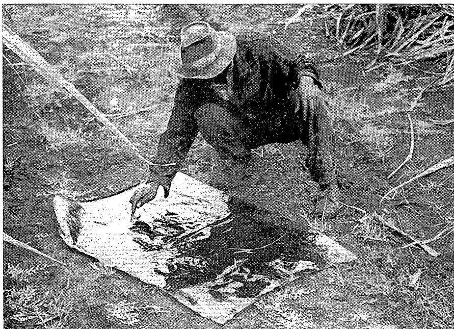
FIGURE 3: Counting Numicia shaken from cane on to adhesive sheet.