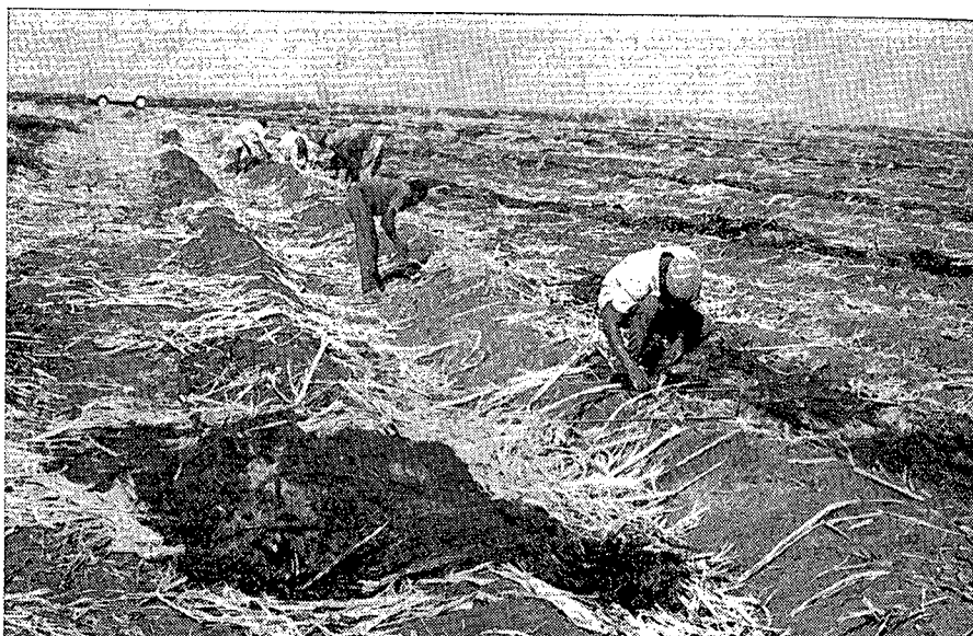
FIGURE 1: Quadrat sampling in a recently-harvested cane field.