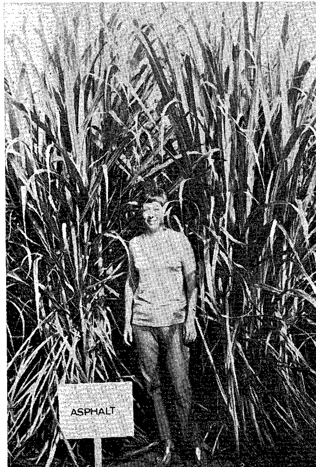
PLATE 1: Effect of asphalt barrier on the growth of sugarcane on Fernwood sand. (Pictures were taken 11 months after planting.)

yield of lucerne is also lower than expected but this can be attributed to a row spacing which is too wide. On the best plots canopy was only achieved about one week before harvest. After the fourth cut, additional rows have been interplanted between the existing rows which will certainly increase yield.