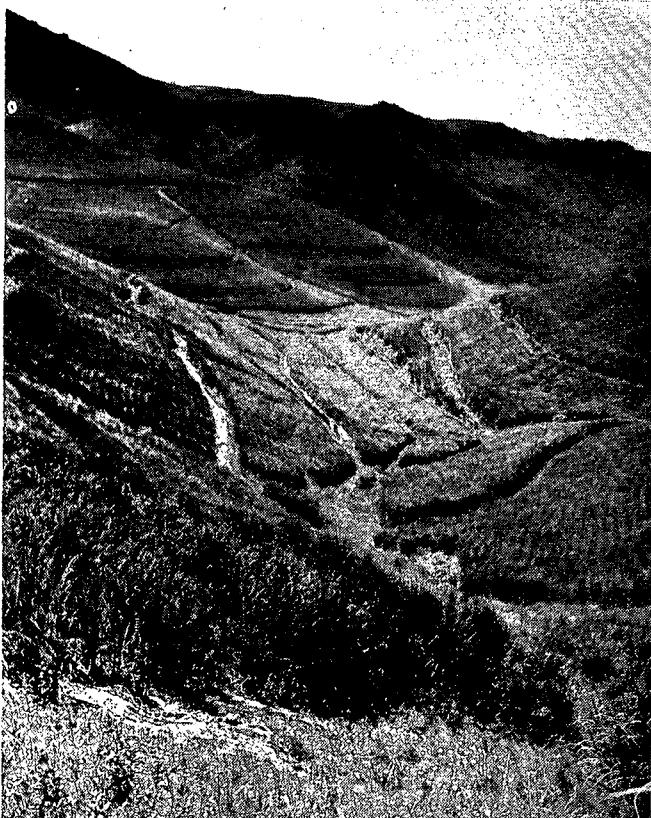
Figure 2: Valley bottom showing twin cut-off and interconnecting roads.

The key to in-field access is to use negotiable crestlines and valley bottoms for main in-field haulage routes, with critical tractor-trailer haulage gradients in mind. Connect crest and valley with standard gradient terrace roads or, if this is not possible, use diagonal roads with maximum gradients of 1:12 or 1:7, depending on the direction of haul. The diagonal roads should be used only if no other solution can be found as they