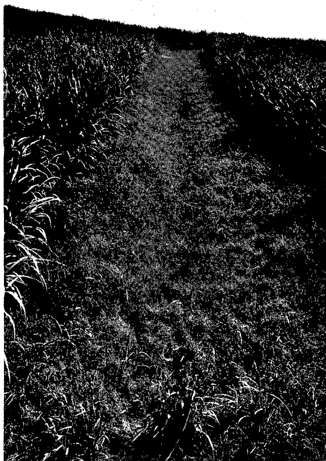
Figure 3: Seeded waterway three months after seeding.

On steep terrain meticulous attention to detail in the above-mentioned operations cannot be over-emphasised, as mistakes can be disastrous.