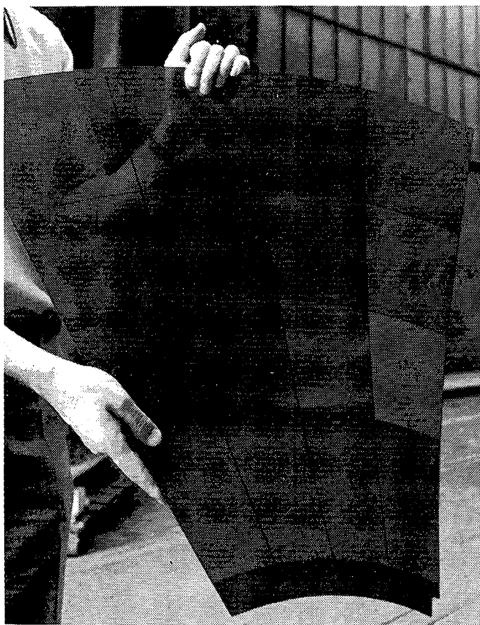
FIGURE 3 Screen design.

200 mm Ø pipe via a pneumatic control butterfly valve. The level of massecuite inside the tank is kept constant by an overflow pipe.