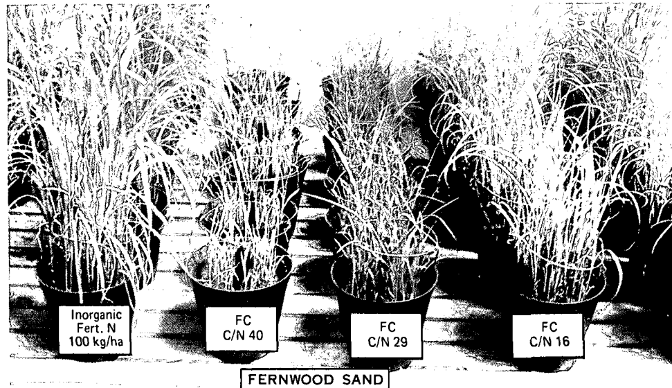
FIGURE 1 The effect of organic fertilizers having different C/N ratios on crop growth on a Fernwood sand.

Two replicates of each soil type were left untreated to serve as control plots. After the appropriate organic fertilizers had been mixed with the soil, all pots were seeded with forage sorghum (babala). The soils were then moistened to 60 per cent of their water holding capacity using a standard P and K nutrient solution, with or without inorganic fertilizer N, according to treatment. All pots were restored to 60