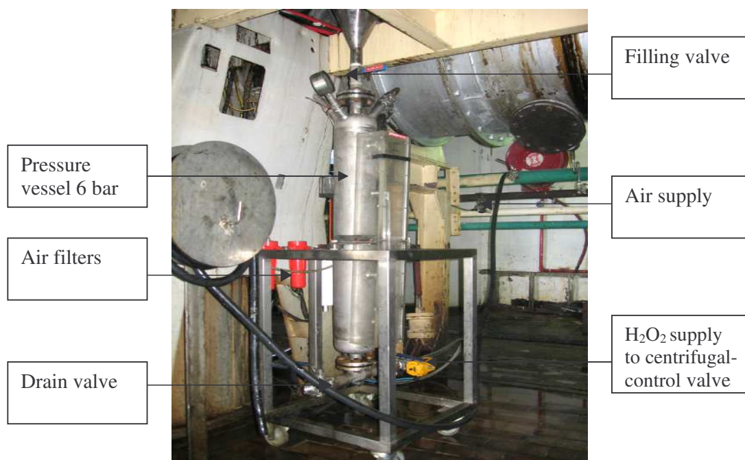
Figure 1. Hydrogen peroxide dosing equipment.

trolley, which allowed for movement to different centrifugals or other mills in the Tongaat Hulett division.