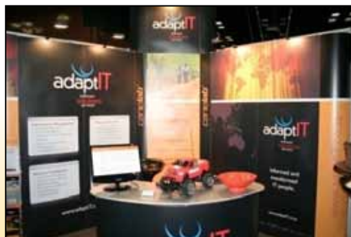
Adapt IT awarded best stand.

Highly commended certificates were also presented to three stands: Improchem, a double stand shared by SMRI/Bruker/Sugarequip, and a