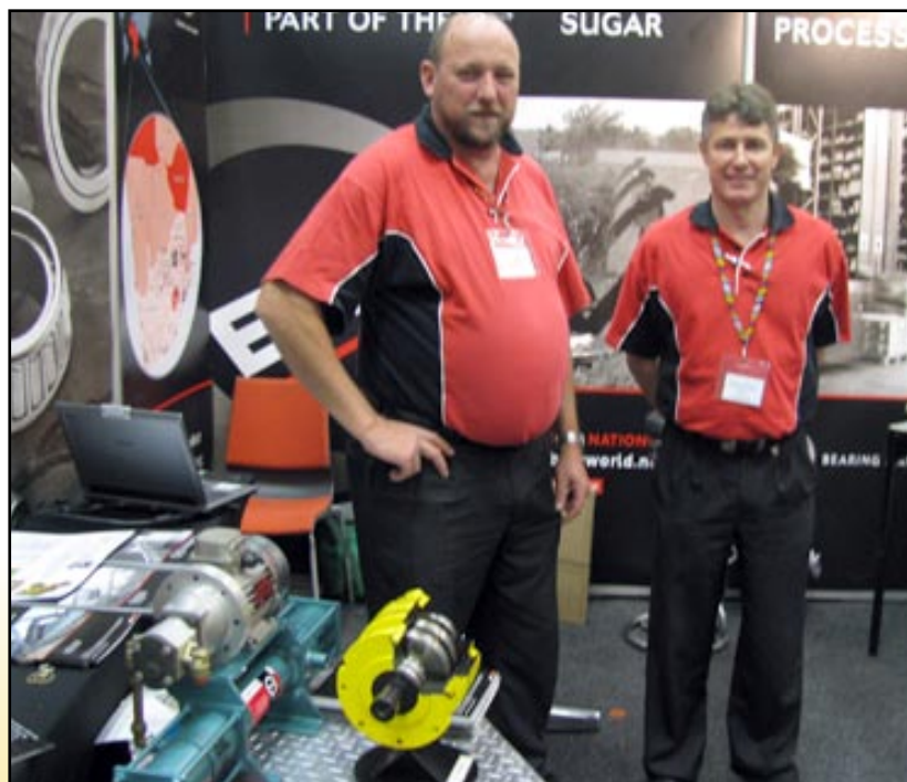
The BMG stand

The large trade exhibition was well supported by local and foreign supplier companies, some old, loyal SASTA friends and some new companies. SASTA thanks all sponsors and exhibitors for participating in this annual sugar industry highlight. The best exhibition stand award was won by BMG, and Highly Commended ex-